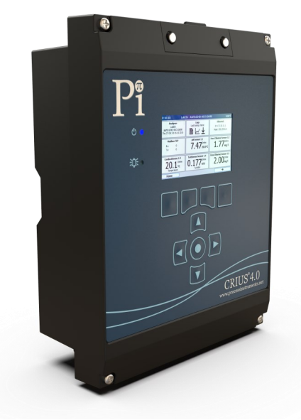
Pi's CRIUS® 4.0 Analyser

Some processes need to be boosted to a higher setpoint periodically and Pi's PID allows a boost setpoint to be triggered manually or remotely.